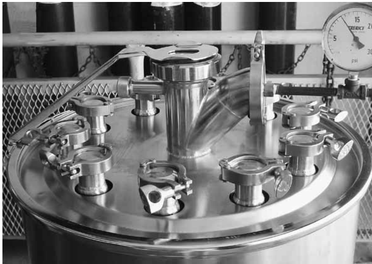
A welding retrofit completed for a manufacturing facility in Andover, Mass.